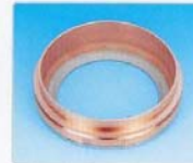
OD FLT Uniline 105-0320