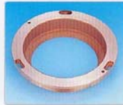
OD ODME 105-0302