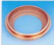
OD Spaceline 105-0318