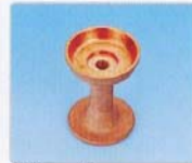
ID Speedline 105-0307