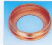
OD Speedline 105-0310