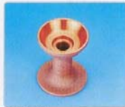
ID Skyline 105-0305