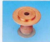
ID FLT Uniline 105-0319