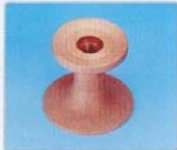
ID Spaceline 105-0317