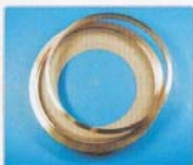
Spaceline Upper & Lower Mask 105-0318B