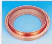
OD Skyline 105-0306