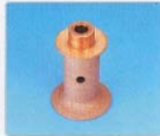
ID ODME 105-0301